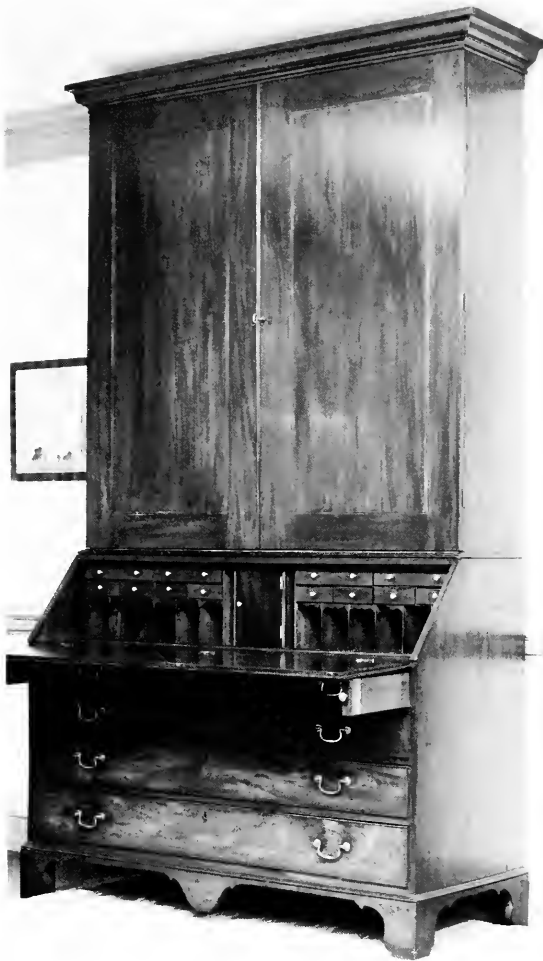
Secretary desk by Jacob Sass; wood and brass; Charleston, S.C.; 1794. HOA 108"; WOA 61¼"; DOA 26". 66.1206A.